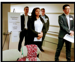
Sessions on poverty and importance of pro bono services