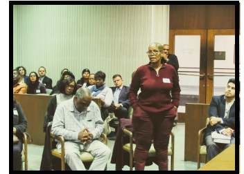
Town Hall attendees

The Committee is meeting regularly to determine next steps and discuss more community outreach, better distribution of resources and information to the public, training of service providers on giving legal referrals, and other education programs. The next Committee meeting is scheduled for May 16, 2019.